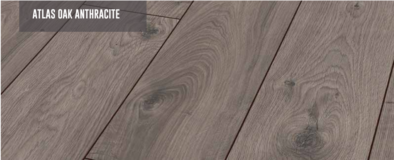
ATLAS OAK ANTHRACITE