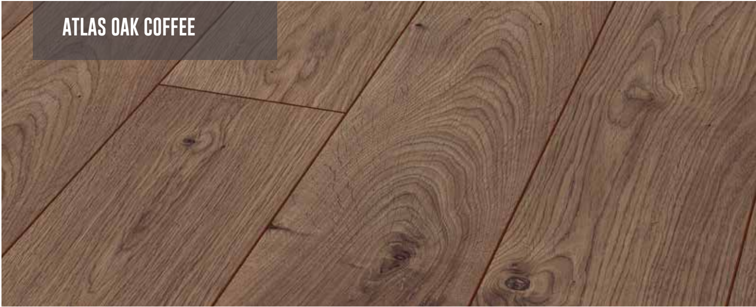
ATLAS OAK COFFEE