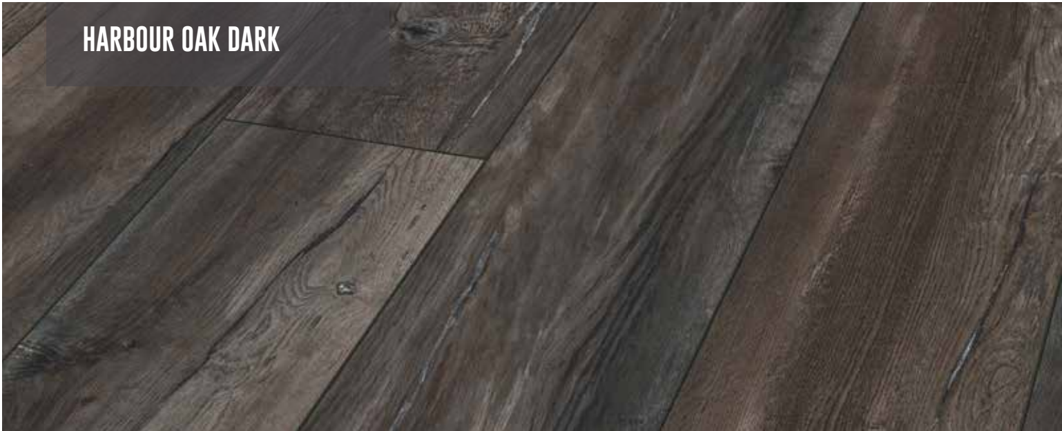
HARBOUR OAK DARK